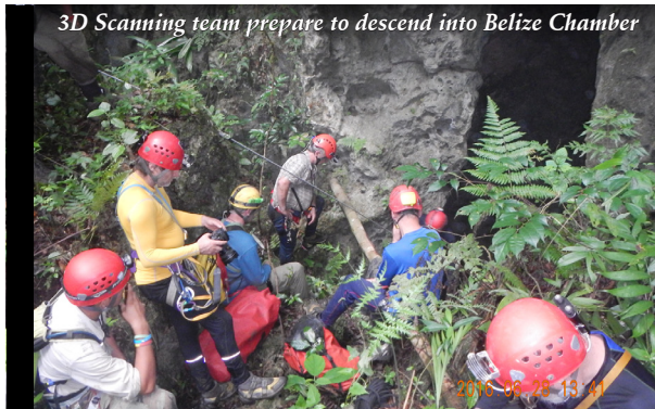
3D Scanning team prepare to descend into Belize Chamber