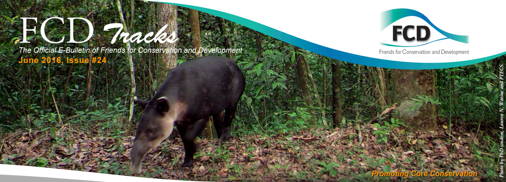
Promoting Core Conservation