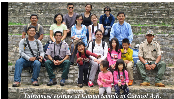
Taiwanese visitors at Caana temple in Caracol A.R.

that spans over 289,000 acres, the hotspot areas can easily be isolated to that area nearer to the western border with Guatemala.