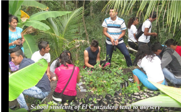
School students of El Cruzadero tend to nursery.